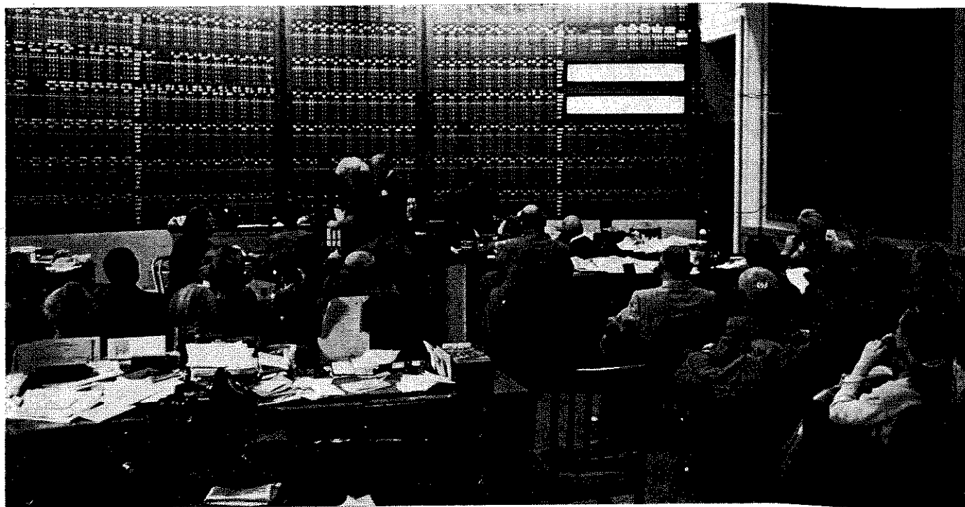
WATCHING THE PRICES IN A BROKER'S OFFICE